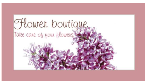
Figure 2. Example your own design– Landscape front