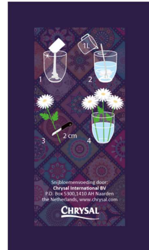
Figure 3. Example your own design – Portrait reverse

Remember; use the same colour in the outer frame as on the front of the sachet.