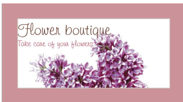
Figure 2. Example your own design– Landscape front